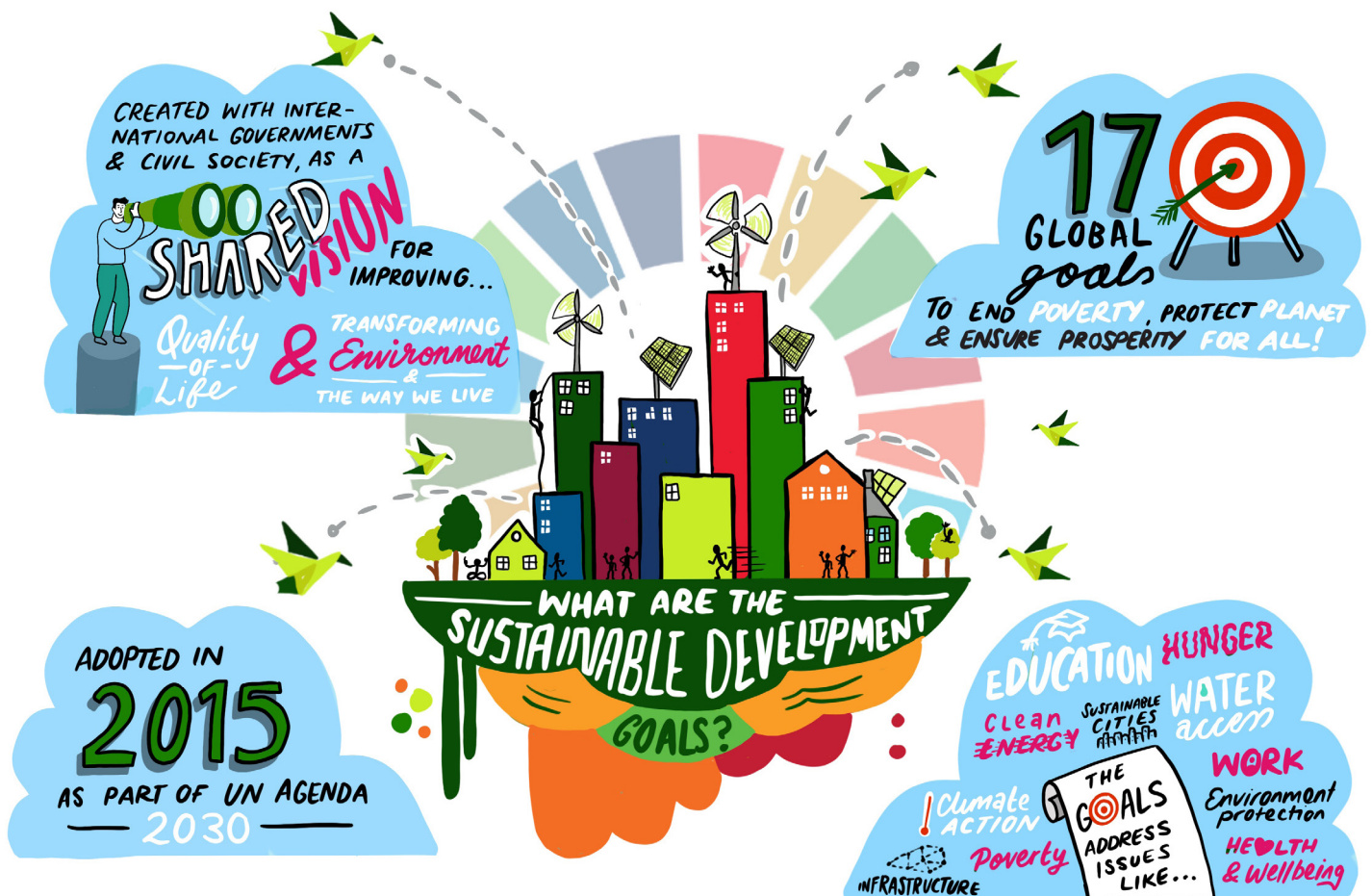
Fig. 1 What are the SDGs?

The good news is there are many people and organisations taking action themselves who are willing to share experiences and work together. This was the main message that came out of a UK-wide workshop on Localising the Sustainable Development Goals that we hosted in Sheffield in June 2019, which invited local government, city region and civil society stakeholders to exchange knowledge and ideas for action.