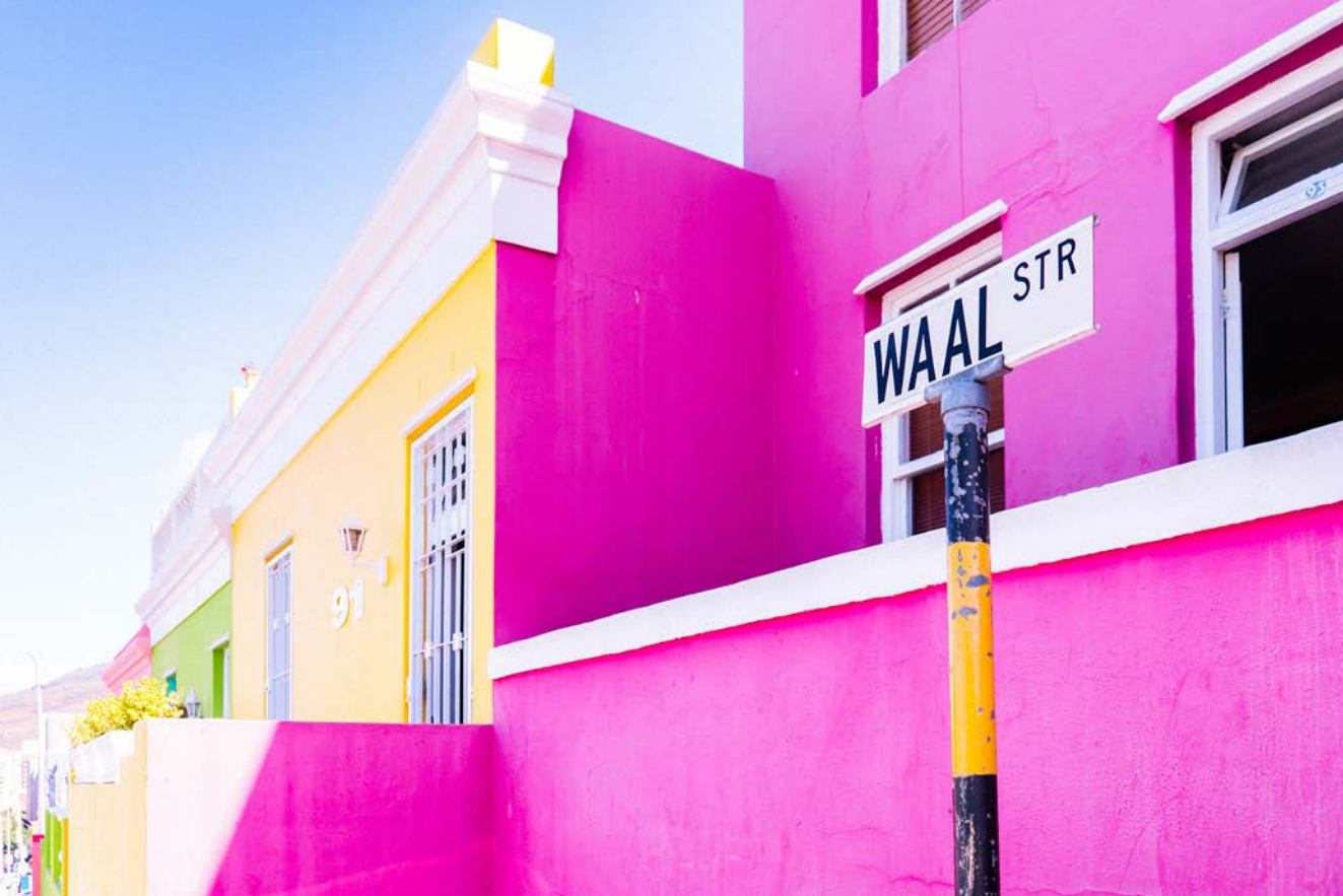
Cape Town.