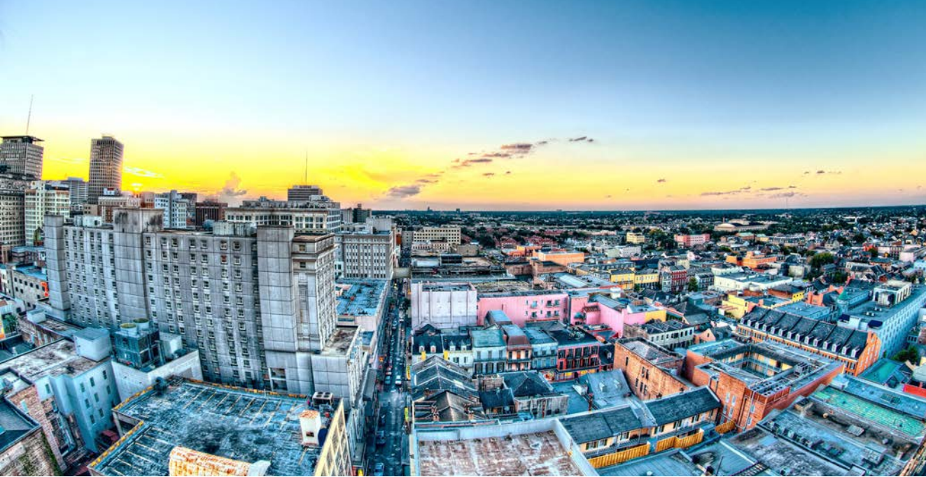
New Orleans.