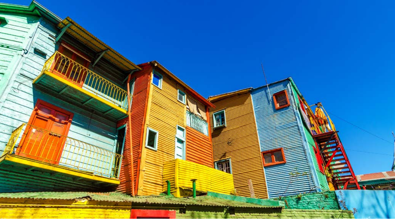
Buenos Aires.