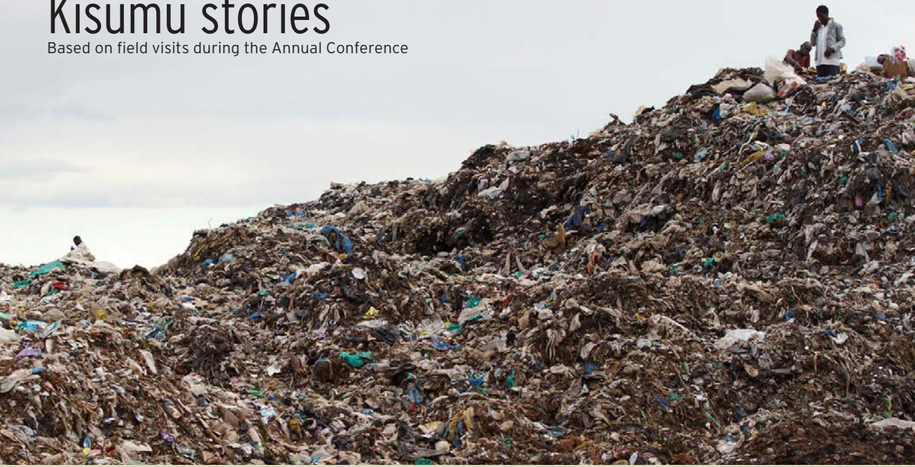
Kachok Dump, Kisumu.

Based on field visits during the Annual Conference