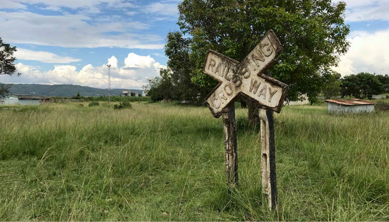
Kisumu.