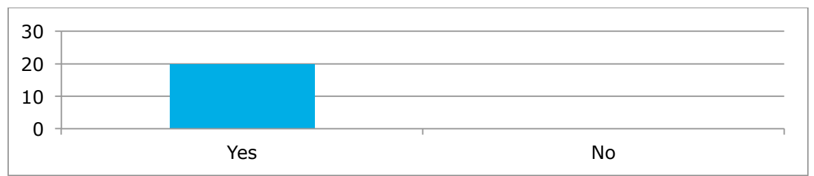
Figure 1: If MUF has provided new networks or collaborations (n=20)

One question in the interviews was how the tight collaboration with practitioners has created benefits for the researcher. Here, the participation of the City of Gothenburg and the interest of doing joint research from the public organisations is one example where collaboration is seen as very positive. Some researchers say that access to an informal network (and to not be isolated) creates a value. One of the interviewed researchers explains this as follows: